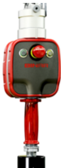
Article No: 012847

The figures are to be seen as indications and will vary depending on lifting objects.